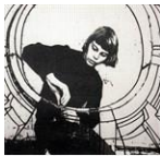
Lee Bontecou , 2005 Graphite on paper 19 x 20 ½ inches (48.3 x 52.1 cm) Private Collection