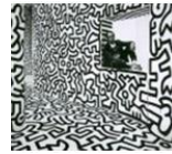
Keith Haring, 2007 Graphite on paper 22 ¾ x 23 ¾ inches (57.8 x 60.3 cm)