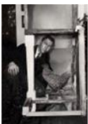
Robert Rauschenberg, 2018-19 Graphite on paper 22 x 17 inches (55.9 x 43.2 cm) Private Collection, New York