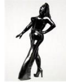
Leigh Bowery , 2006 Graphite on paper 23 x 19 inches (58.4 x 48.3 cm) Courtesy Beth Rudin DeWoody