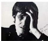
Homage to Bas Jan Ader II (I'm too sad to tell you) , 2005 Graphite on paper 18 x 19 ¾ inches (45.7 x 50.2 cm) Private Collection, New York