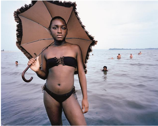
Wayne Lawrence, "Untitled" (2005) (courtesy the artist/INSTITUTE)

Orchard Beach in the Bronx doesn't exactly have the best reputation. While the 1.1 mile stretch of beach, formed from landfill and sand shipped in via barges, was declared "The Riviera of New York" when it opened in the 1930s under the direction of Parks Commissioner Robert Moses, its profile has since declined. It's been named one of the five boroughs' dirtiest beaches, according to the Natural Resources Defense Council, and some people even forget it's there. Yet Orchard Beach is still the Bronx's only public beach, and when summer arrives the locals who love it embrace the sandy shores.